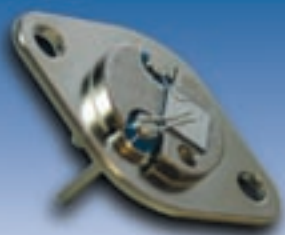
V-MOS Transistor open, case TO-3