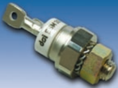
ESM 3004/DSI Highpowertransistor